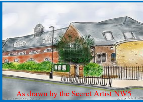
As drawn by the Secret Artist NWS