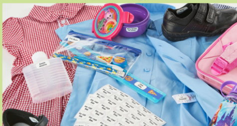
One easy name label with multiple uses for all kinds of personal items, including clothes and shoes.