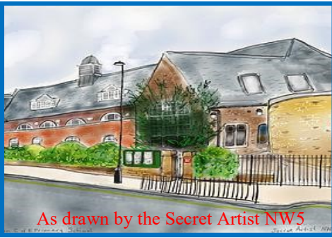
As drawn by the Secret Artist NW5