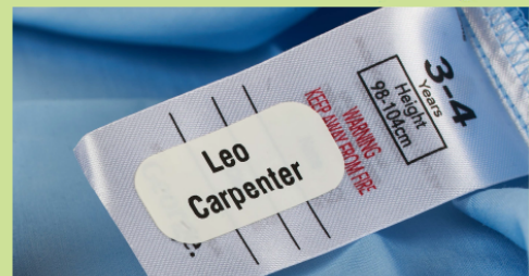
Only apply Stikins onto the wash-care label of clothes, never directly onto the fabric or any other label.