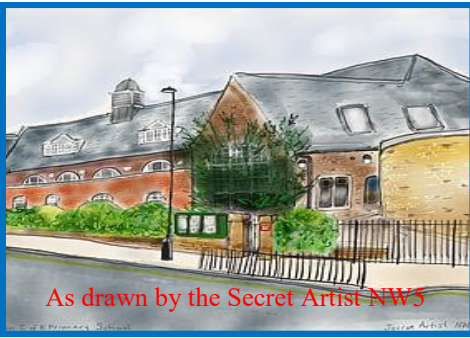
As drawn by the Secret Artist NW5