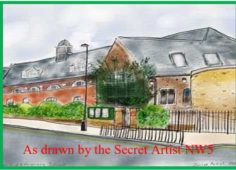
As drawn by the Secret Artist NWS